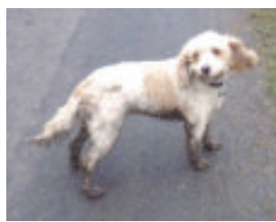
Muddy Boots - Muddy Dog!

It was a glorious morning and an uphill walk across the Hickling Standard - over stiles and muddy fields - rewarded us with superb views of the surrounding countryside before finally taking us round and back towards the pub. The fresh air and exercise had built up our appetites, even the dogs were excited and we were